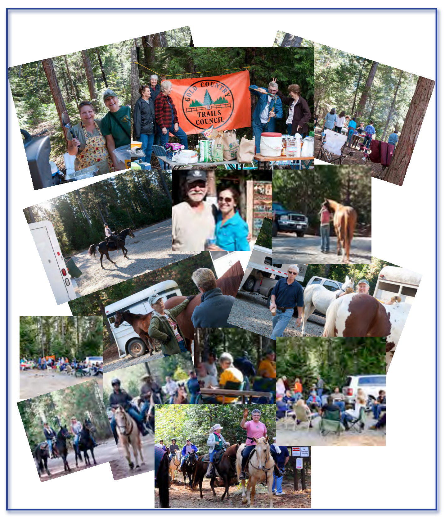
Gold Country Trails Council Membership Ride held at Lone Grave off Hwy 20. Great Ride and a Great BBQ all with good friends. Thanks to all.