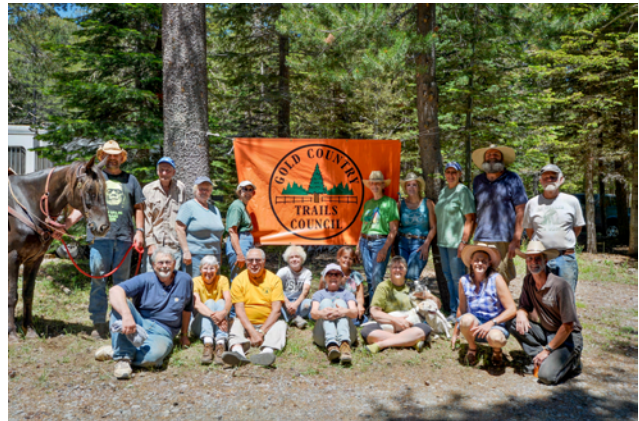
Little Lasier Meadow work crew from June 2013. Beautiful location and weather, scenic trails, lots of work accomplished, scrumptious potluck, fun for all.